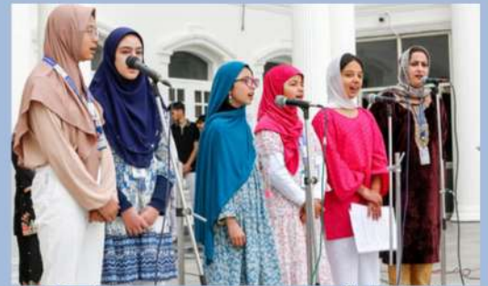
Students presenting a soulful Naat Sharif during the Eid celebration.

Students, dressed in colourful attire, presented a soulful Naat Sharif, a traditional Rouf performance and a melodious song. They also shared their personal experiences of celebrating Eid and reflected on its true meaning.