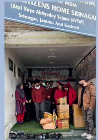
The Joy of Giving: Our senior students and faculty members presenting essential supplies to the "Home of Heaven," marking the culmination of our Ramadan SEWA drive

These acts of kindness reflected values of compassion, generosity and social responsibility. The initiative highlighted the importance of giving, empathy and service, encouraging students to contribute positively to society and understand the true essence of Ramadan.