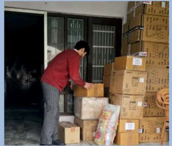
Heart in Every Box: A Goenkan meticulously organizing and stacking donations, ensuring every essential item is ready for distribution to those in need.

In the spirit of the holy month of Ramadan, students of GD Goenka Public School, Srinagar actively participated in a meaningful SEWA initiative. Guided by their teachers, students collected and organized essential items, which were distributed to an orphanage and a senior citizens' home.