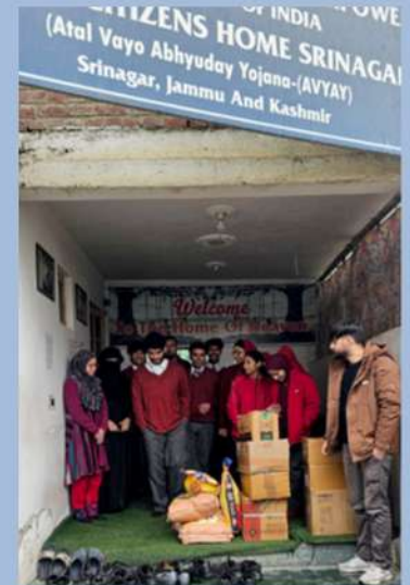
The Joy of Giving: Our senior students and faculty members presenting essential supplies to the "Home of Heaven," marking the culmination of our Ramadan SEWA drive

These acts of kindness reflected values of compassion, generosity and social responsibility. The initiative highlighted the importance of giving, empathy and service, encouraging students to contribute positively to society and understand the true essence of Ramadan.