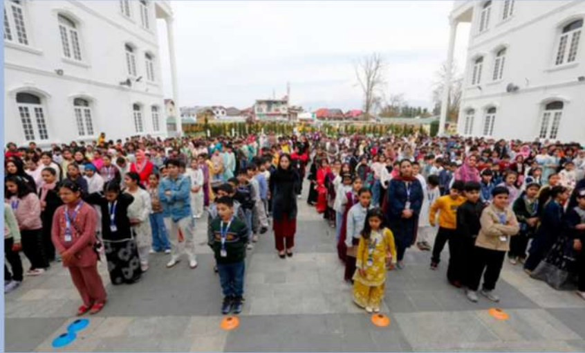
Students assembled for the Eid Milan celebration at GD Goenka Public School, Srinagar.

Special assemblies were held to celebrate Eid-ul-Fitr at GD Goenka Public School, Srinagar on 23rd March 2026 (Monday) with great enthusiasm and reverence.