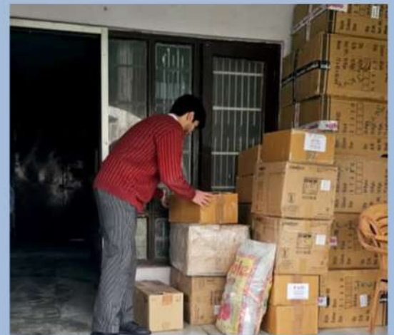
Heart in Every Box: A Goenkan meticulously organizing and stacking donations, ensuring every essential item is ready for distribution to those in need.

In the spirit of the holy month of Ramadan, students of GD Goenka Public School, Srinagar actively participated in a meaningful SEWA initiative. Guided by their teachers, students collected and organized essential items, which were distributed to an orphanage and a senior citizens' home.