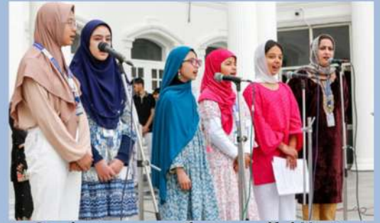
Students presenting a soulful Naat Sharif during the Eid celebration.

Students, dressed in colourful attire, presented a soulful Naat Sharif, a traditional Rouf performance and a melodious song. They also shared their personal experiences of celebrating Eid and reflected on its true meaning.