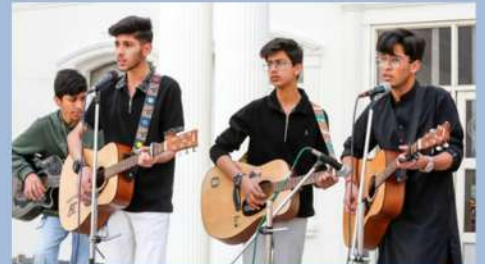
Students performing a melodious song as part of the Eid celebrations.