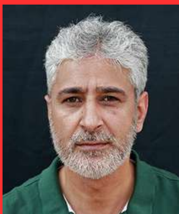
Mr Fayaz Kabli Photo - Credits